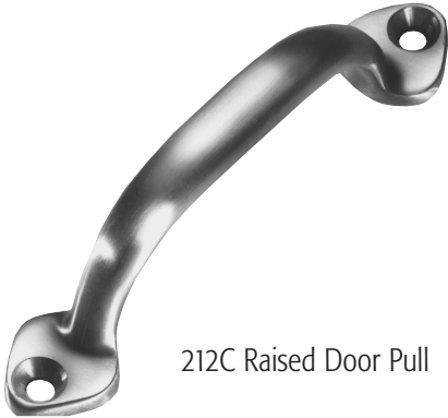
212C Raised Door Pull