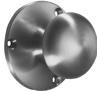
215C Knob Pull